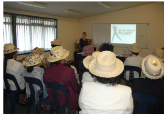
Nuiean Church Group Mangere, Auckland

Another year of Roadshows is set to kick off starting in February, with our Breast Health Educators traveling around the country to teach and inform our communities about breast cancer. If you would like more information on where and when the Roadshows will be near you, please visit our website www.nzbcf.org.nz/education or check out your local newspaper. Special thanks goes to the Lion Foundation, whose sponsorship makes it possible to deliver these key life-saving messages throughout New Zealand